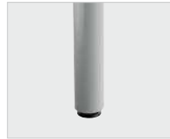
POST LEG GLIDE