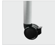
POST LEG CASTER Available on 24" and 30" D tables only.