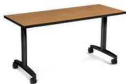
T-LEG Unobstructed leg room (glides or casters)