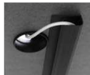
WIRE MANAGEMENT STRIPS