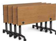
NESTING BASE Space-efficient storage (casters only)