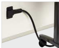
POWER ENTRY CABLE