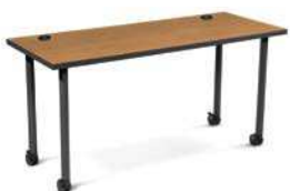
POST LEG Sturdy and affordable (glides or casters)

Time is money, and space is serious overhead. Huddle multi-purpose tables work with you to make the most of both. Tables are available with a choice of top shapes (rectangular or half-round) and bases (post legs, T-legs, or nesting bases). With a variety of options to choose from, you can specify Huddle tables that are easy to set up and easy to rearrange.