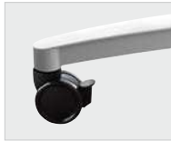
NESTING BASE/ T-LEG CASTER