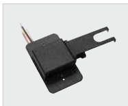
POWER ENTRY PLATE