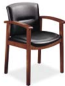
H5003 4-LEG GUEST CHAIR