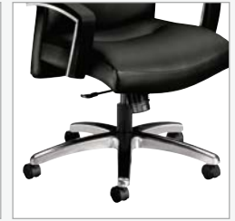
POLISHED ALUMINUM BASE