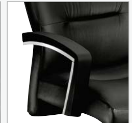
POLISHED ALUMINUM ARMS