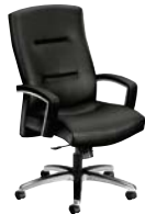
H5021 HIGH-BACK EXECUTIVE CHAIR