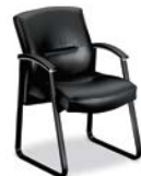
H5023 SLED BASE GUEST CHAIR