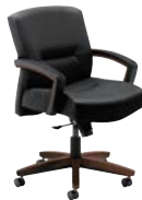
H5002 MID-BACK TASK CHAIR