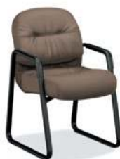
SLED BASE GUEST CHAIR