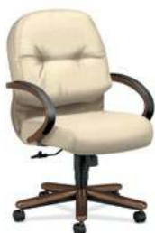
MID-BACK CHAIR FEATURES MEMORY FOAM