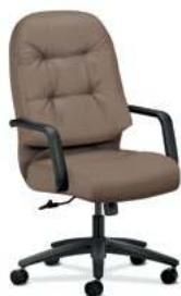
HIGH-BACK CHAIR FEATURES MEMORY FOAM