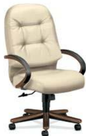
HIGH-BACK CHAIR FEATURES MEMORY FOAM