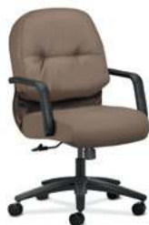
MID-BACK CHAIR FEATURES MEMORY FOAM