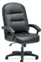
HIGH-BACK CHAIR (Limited fabrics only)